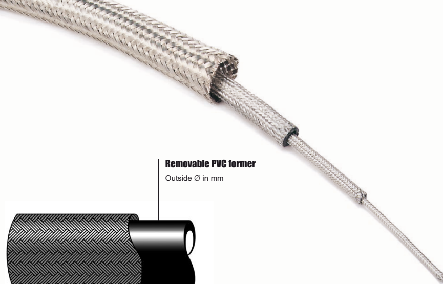
Removable PVC former